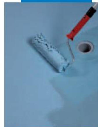
Application by roller of Mapelastic AquaDefense second coat