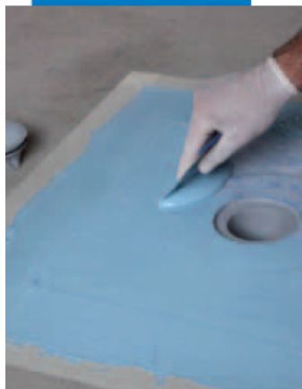
Impregnating Drain Vertical fabric with Mapelastic AquaDefense