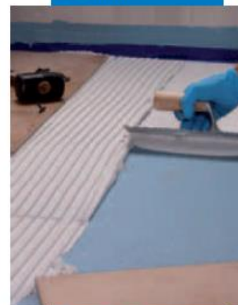
Bonding tiles on Mapelastic AquaDefense

Bond values according to EN 14891 measured using Mapelastic AquaDefense and a C2-type cementitious adhesive according to EN 12004