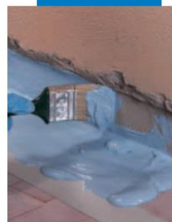
Application of Mapelastic AquaDefense by brush between floor and wall before applying Mapeband