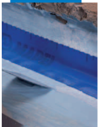
Application of Mapeband on a wall-floor fillet joint with Mapelastic AquaDefense